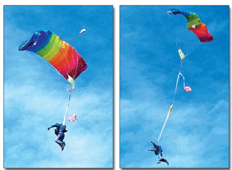
Elapsed Time: 0.5 seconds

In the last 10 years, 24 jumpers in the US alone, have died after breaking away and not pulling their reserves. Another 4 died after entangling with their deploying reserve. The Skyhook gets rid of all those arguments for not using an RSL, and actually gives you some very good reasons to use one. And remember, because the Skyhook is a part of your RSL system, it can be released at any time, before or during the jump, by simply pulling the little yellow tab.